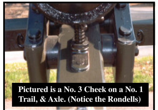
Pictured is a No. 3 Cheek on a No. 1 Trail, & Axle. (Notice the Rondells)

Notice the smoothness of our Trunnion Plates. Our Competition still have casting seam visible